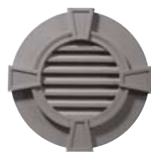
30" ROUND with KEYSTONES