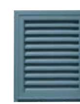
Rectangle & Square