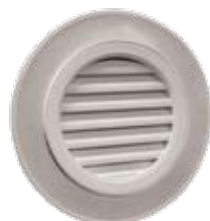
28" ROUND without KEYSTONES