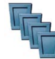
Gable Vent Keystone 00 40 0000 ***